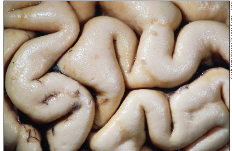
Cleverly done A close-up of the cerebral folds on the surface of a human brain. Folding may reflect optimization to minimize the "wire" length of internal connections.

a "zero" – a single bit of information. These transitions are often triggered by biochemical signals that are generated when the sending and receiving neuron fire in close succession, and jumps in strength may increase the likelihood of the re-occurrence of a particular activity sequence, a repetition that may underpin the first stages of how we store memories and recall past events.